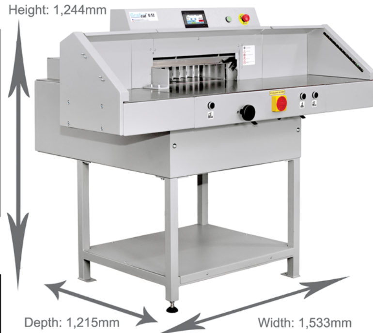
Above: G52 with the Optional Side Tables