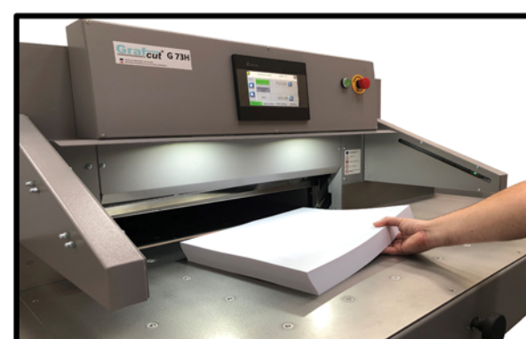
SICK IR Safety Curtain with Traffic Light Indication