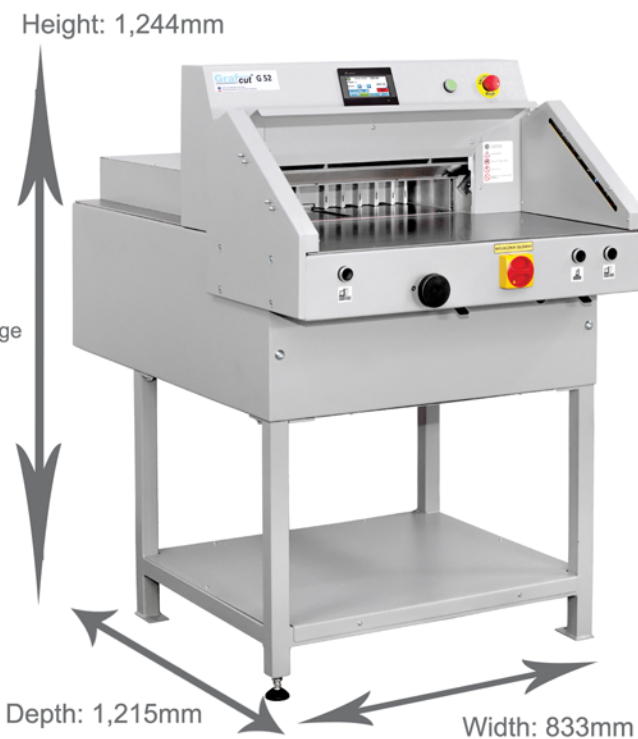
Below: G52 without the Optional Side Tables