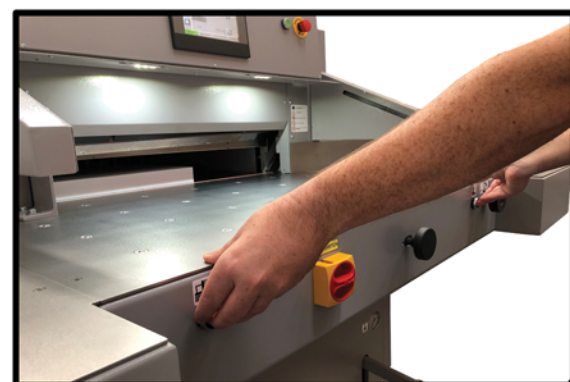
True Twin Trigger Blade Activation Via Safety Controller

The combination of the fully adjustable clamping pressure with the addition of a removable false clamp plate ensures that no matter how delicate the work, the Grafcut can handle it effortlessly.