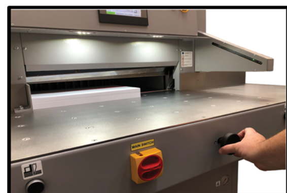
Push & Lock Fine Adjust Dial for Perfect Positioning