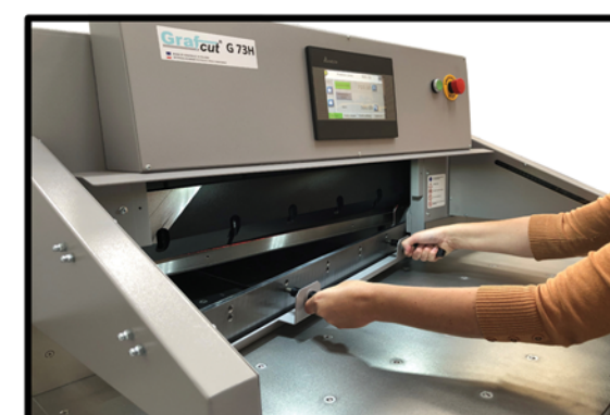
Safe Blade Change Procedure with Cradle