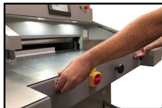
True Twin Trigger Blade Activation Via Safety Controller

The combination of the fully adjustable clamping pressure with the addition of a removable false clamp plate ensures that no matter how delicate the work, the Grafcut can handle it effortlessly.