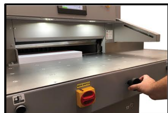
New Electronic Fine Adjust Dial for Perfect Positioning