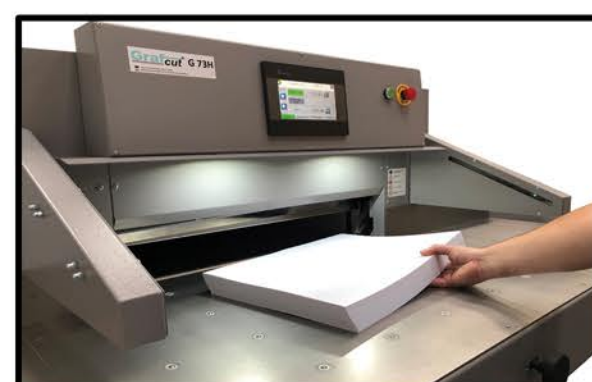
SICK IR Safety Curtain with Traffic Light Indication