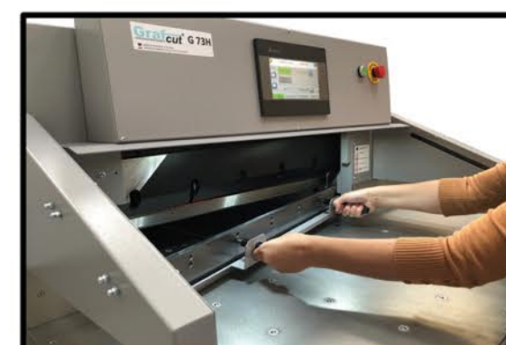
Safe Blade Change Procedure with Cradle