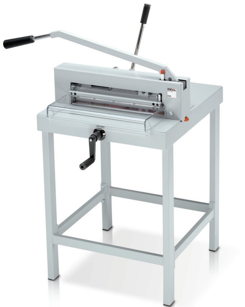
IDEAL 4305 with optional stand