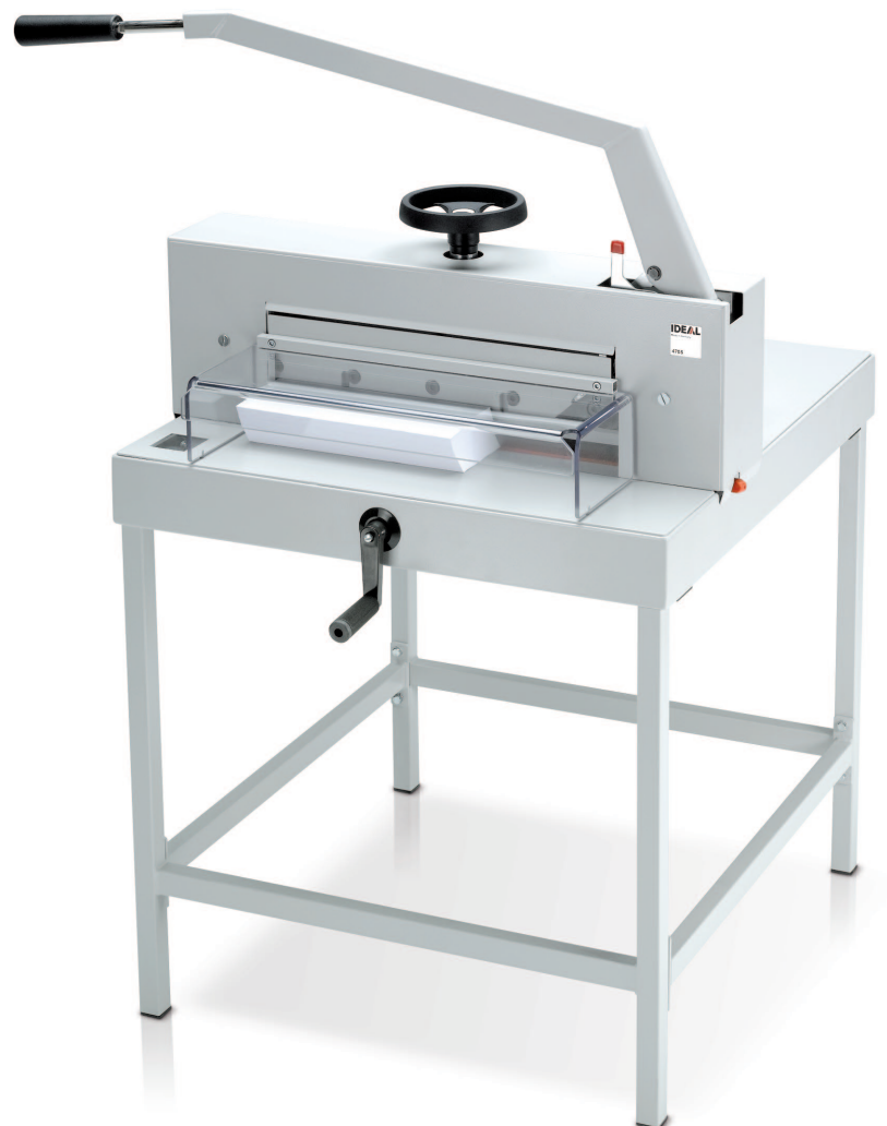
IDEAL 4705 with optional stand