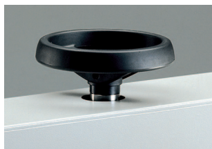
Spindle clamp: the variable clamp pressure is applied via the hand wheel to both ends of the clamp for firm pressure across the entire cutting line.