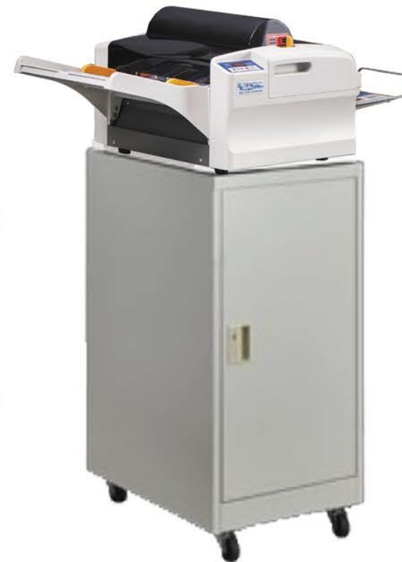
Below: Revo Office with Optional Mobile Storage Stand