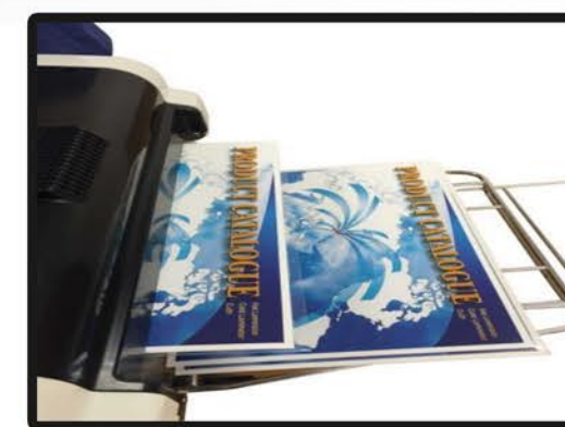
Autonomous Cutting with Adjustable Border