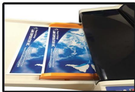
Autonomous Paper Feed

Load up to 200 sheets and press 'Start'. Let the Revo Office do the laminating whilst you complete another task.