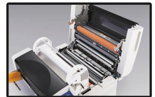
Clamshell Design Allows for Easy Maintenance