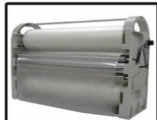
Unique Film Cassette for Easy Loading