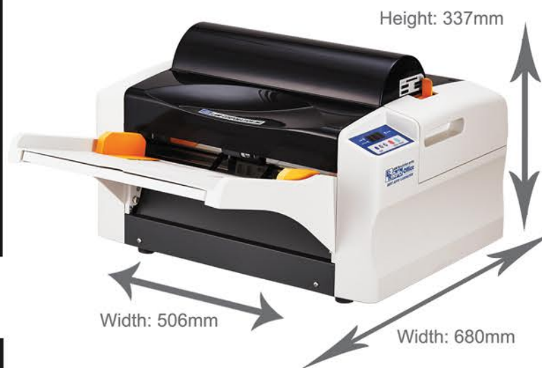
Above: Revo Office in Desktop Setting

The Perfect Laminating Solution for the Education Market, removes the bottleneck associated with traditional forms of laminating whilst producing stunning results without the need for an operator