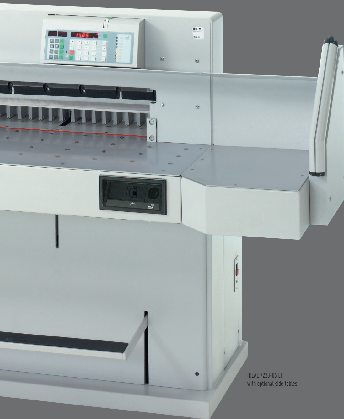
IDEAL 7228-06 LT with optional side tables

Digital display for measurement readout in cm or inches (display accurate to 1/10 mm or 1/100 inch) | 10-button key pad for pre-setting of measurement | memory key for repeat cuts (manual) and additional automatic memory | three programmable keys for quick setting of frequently needed measurements | professional control module for storing 40 programs with up to 36 steps each (program runs automatically – with electronic cutting monitor in the program and memory mode) | up to 9 repeat cuts can be integrated into a program as one single program step | paper EJECT function with and without program mode (advancing programmable) | DELETE and INSERT mode for correcting and modifying programs | automatic measuring correction in case of backgauge displacement | push buttons for fast backgauge movement (forward and reverse) | electronic hand wheel for manual backgauge positioning with infinitely variable speed control (from very slow to very fast) | integrated calculator | "Set" function key for reference measurement | self-diagnostic system with error indication on display