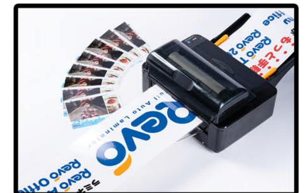
Automatically Laminates Long Banners Too