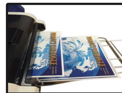
Autonomous Cutting with Adjustable Border