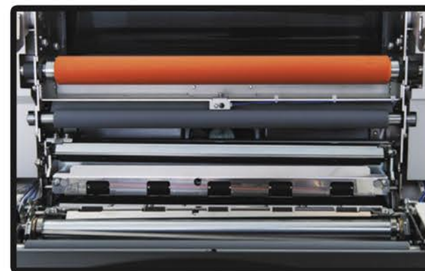
The Patented Cyclone Cutter

The Revo Office incorporates a totally unique and patented cutting blade known as "The Cyclone Cutter". Unlike traditional rotary methods which require a pause in the laminating process to complete the cutting action, which often leaves a mark in each laminate due to the pressure applied by the rollers, the Cyclone Cutter uses a rotating action to cut the laminates precisely as they travel through the machine. Not only does the laminate not need to pause but thanks to the design, based on a sheer action, the blade never goes blunt and requires zero maintenance.