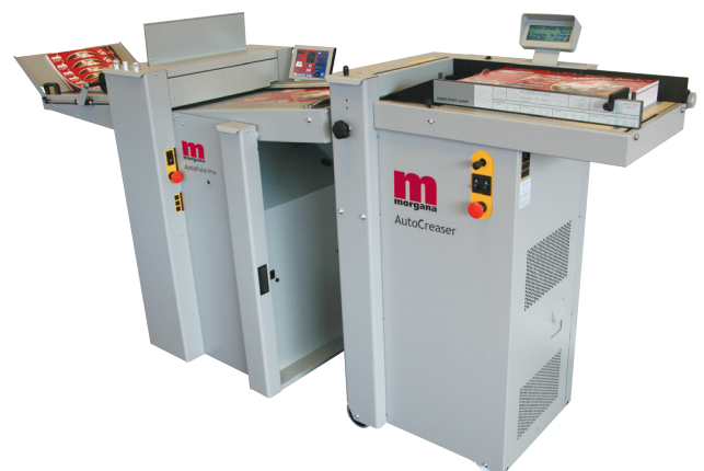
Picture shows AutoFold Pro with Morgana AutoCreaser

The beauty of the AutoFold Pro is its simplicity allowing the user of ANY manufacturer's creaser to invest in one and to improve their productivity and quality immediately.