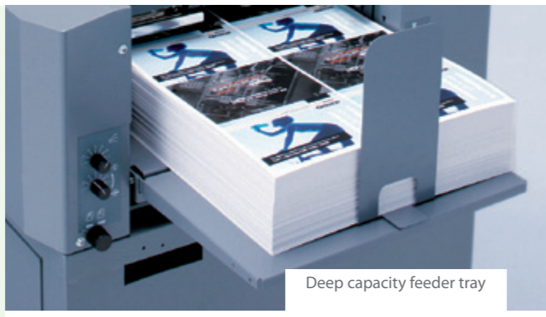
Deep capacity feeder tray