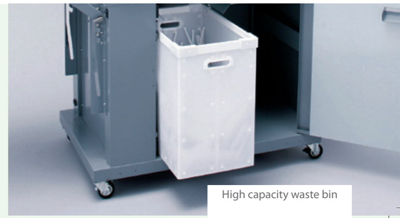
High capacity waste bin