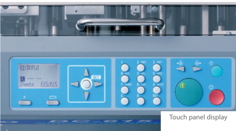
Touch panel display