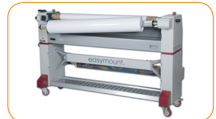
Rear mandrel swings-out for easier loading of laminate