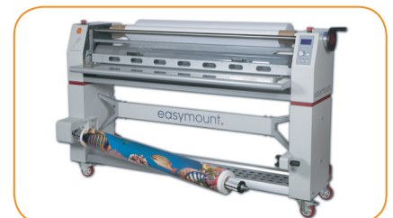
Front mandrel swings-out for easier loading of vinyl